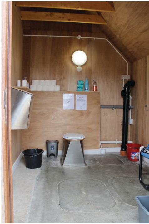
Toilet - composting, in its own space