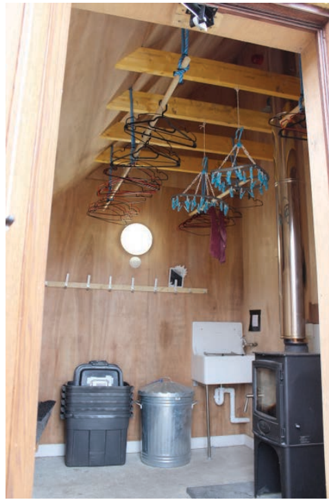
Drying Room - for all your wet clothing + private washing space