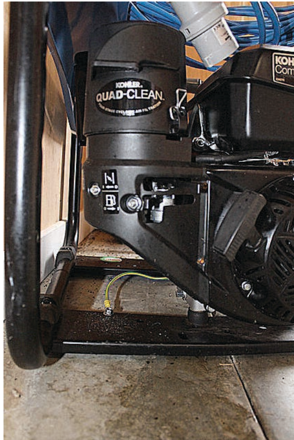
Choke and fuel levers

7. Immediately move the choke lever to I (OFF)- otherwise it will splutter and run too slowly.