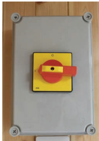
Change-over switch in the porch - upper left from the door