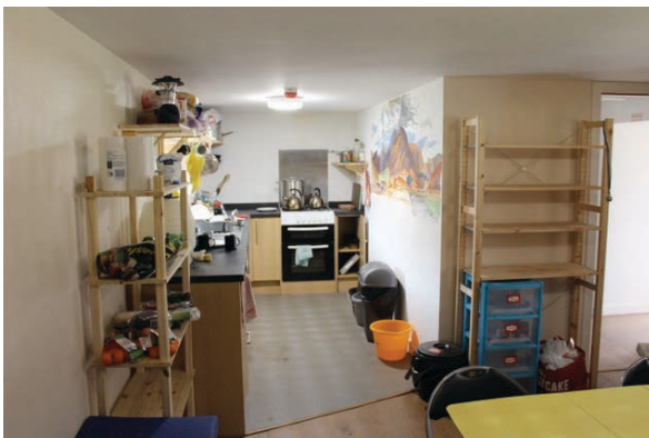
Kitchen (off the Common Room)

Kitchen - fully equipped with cooking and eating gear