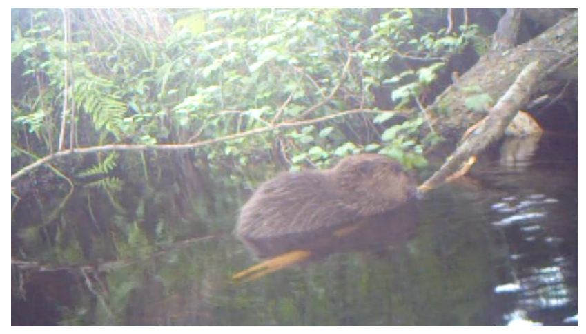
Still from TfL camera trap in Strathglass, June 17

The fieldwork phase of our work aimed to survey the riverbanks and create a map of the locations and quantity of beaver field sign like chewed tree stumps and timber. When we started however, we were very surprised to discover not just old field sign from previously escaped beavers, but signs of an ongoing presence still on the river. This turned to shock in June 2017 when we found that this presence included a lodge with an actively breeding family. Our camera traps provided evidence of a family with two adult beavers, two sub-adults born in 2016 and two beaver kits born 2-3 months earlier in spring 2017. We have since had reliable reports of two separate animals living singly on the river – one above and one below the large Aigas and Kilmorack hydro dams on the river.